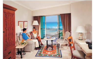
Guest Room at Le Meridien Cancun