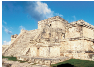
Chichen Itza (approx. 2 hours outside of Cancun)