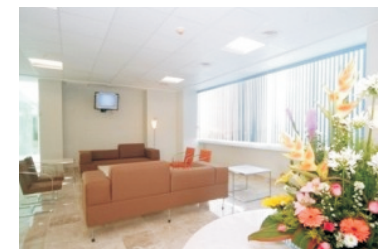
Waiting Area, Galenia Hospital