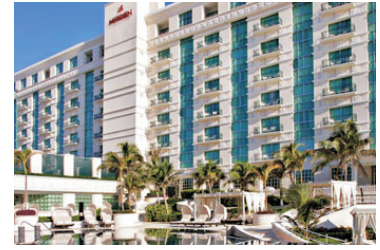
Le Meridien in Cancun

During the procedure, spouses/partners or friends who accompany the patient will wait in the waiting area until the procedure is over and the patient is in recovery. The hospital has a full service cafeteria and coffee shop. There is a multi-story shopping mall with a movie theater and restaurants located three blocks away from hospital. A short cab ride from the hospital to the shopping center should cost $3-5 (US).