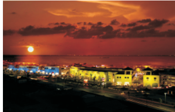
Shopping and Nightlife, Cancun