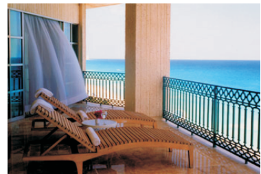
Waterfront view at hotel