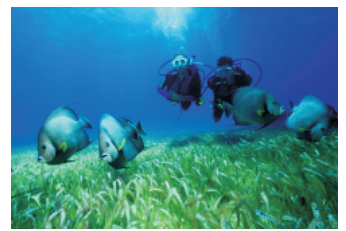
Scuba diving, Cancun